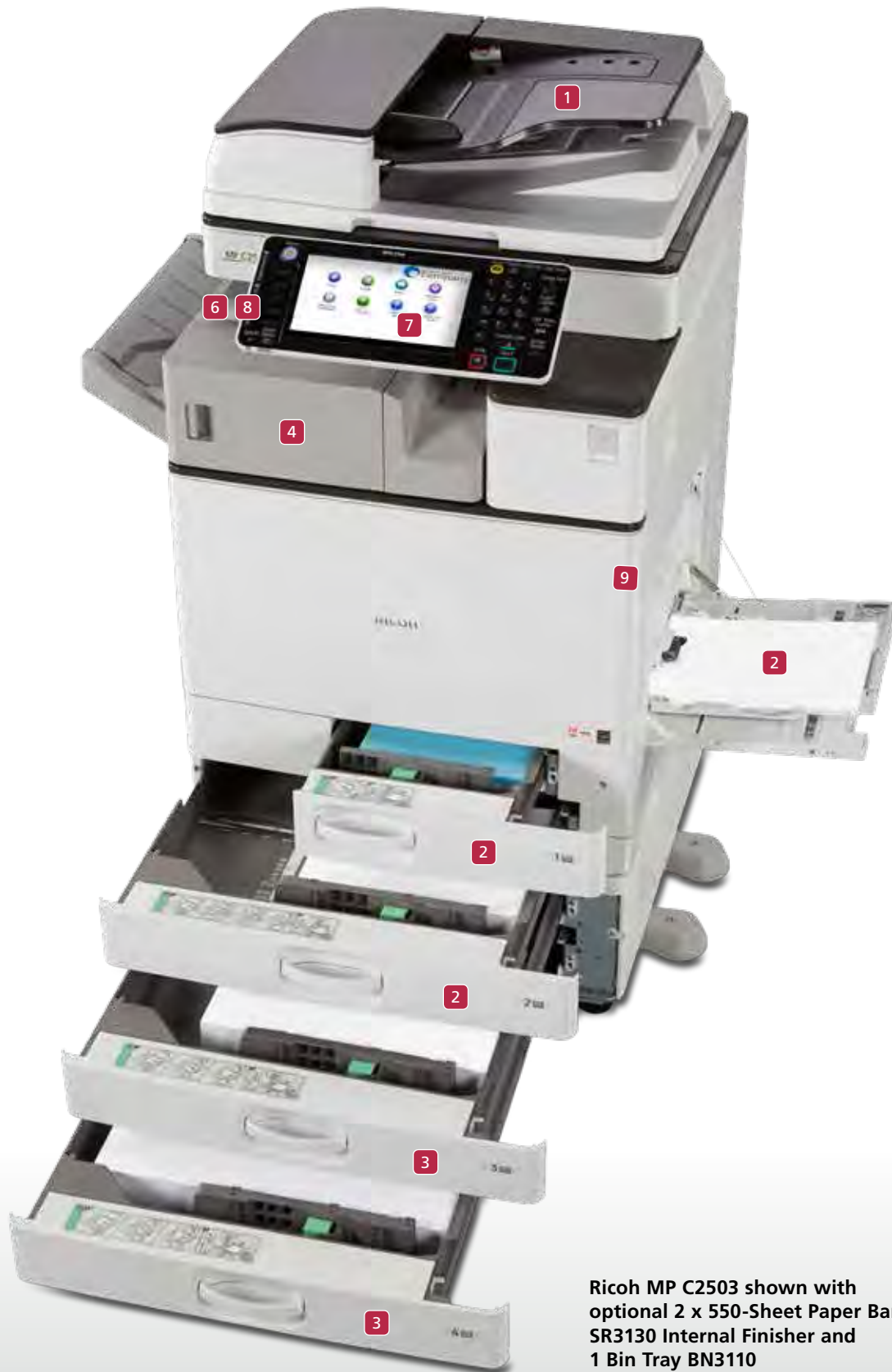
Ricoh MP C2503 shown with optional 2 x 550-Sheet Paper Bank, SR3130 Internal Finisher and 1 Bin Tray BN3110